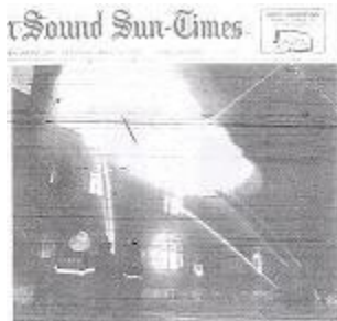
Fire destroys Grey Granite Club

A major fire erupted in the first and second floor Lounge areas of the Grey Granite in the early hours of April 29, 1972, resulting in extensive damage to the Club's interior. It took Owen Sound firefighters over 8 hours to quell the fire with the assistance of a pumper truck from the Inter-Township fire department. A few days later, an investigator from the